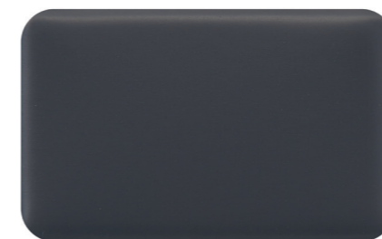
7016 Anthracite Grey