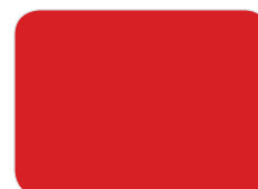
Traffic Red 3020